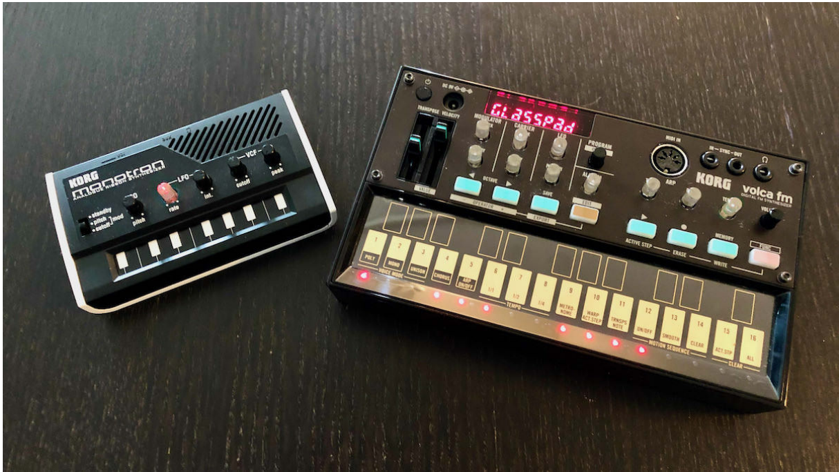
Figure 2: Synthesisers by Charles Martin (Public Domain)

You can include hyperlinks like so: [link text](https://computermusic.org.au).